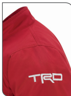
Toyota Racing Development logo

when ordering specify lot#: EL-LS3-ELF153