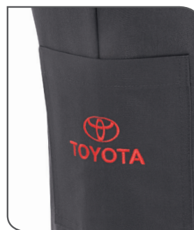
Toyota logo for utility pocket only

when ordering specify lot#: AP-RLS-EP7LTY