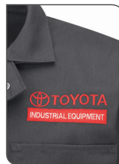
Toyota Industrial Equipment logo

when ordering specify lot#: EL-LUF-ELE330