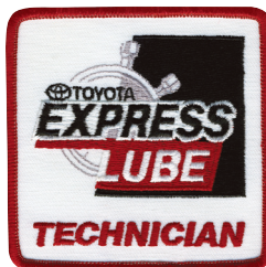
Toyota Express Lube logo

when ordering specify MDC#: 00450-TECHN-PATCH