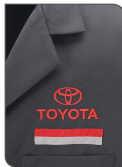
Toyota logo with fabric stripes

when ordering specify lot#: T1 extension