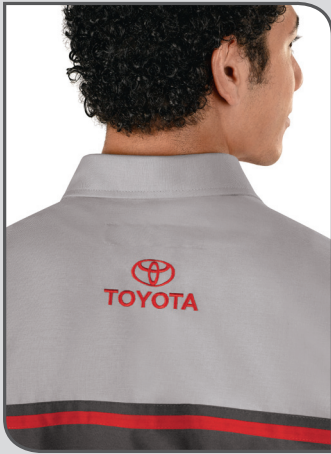
Back embroidery ELE618 comes stock on Tech Shirt