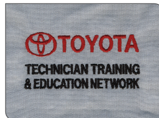
Toyota Technician Training & Education Network logo

when ordering specify lot#: EL-LUF-EL1259