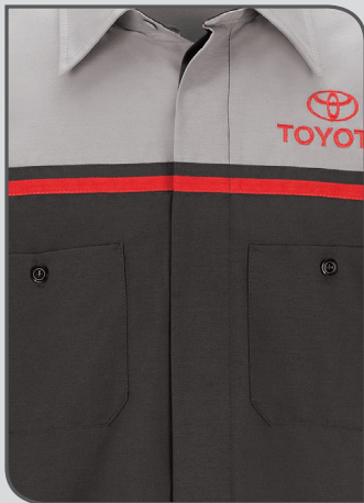
Concealed no-scratch button front