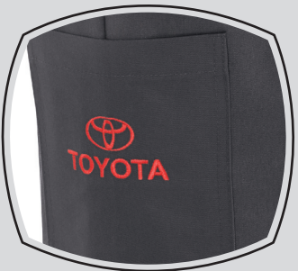
Utility pocket embroidery AP-RLS-EP7LTY comes stock on Men's Tech Work Pants